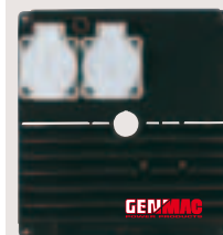
2500R / 3500R / 5000R / 3000L