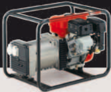
Zip 2500R Click 3500R