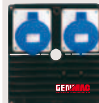
5000L / 7300R